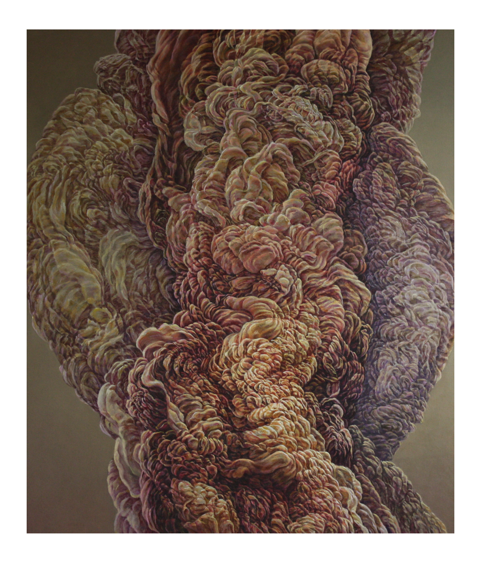
\mbox{\it Untitled} , 2010. Oil on canvas. 140 x 166 cm.